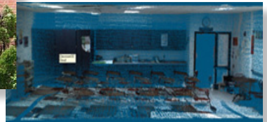
Northwood-Kensett High School - left to right: 2D floor plan created by TIMMS; TIMMS in front of School and LiDAR overlay of class room.